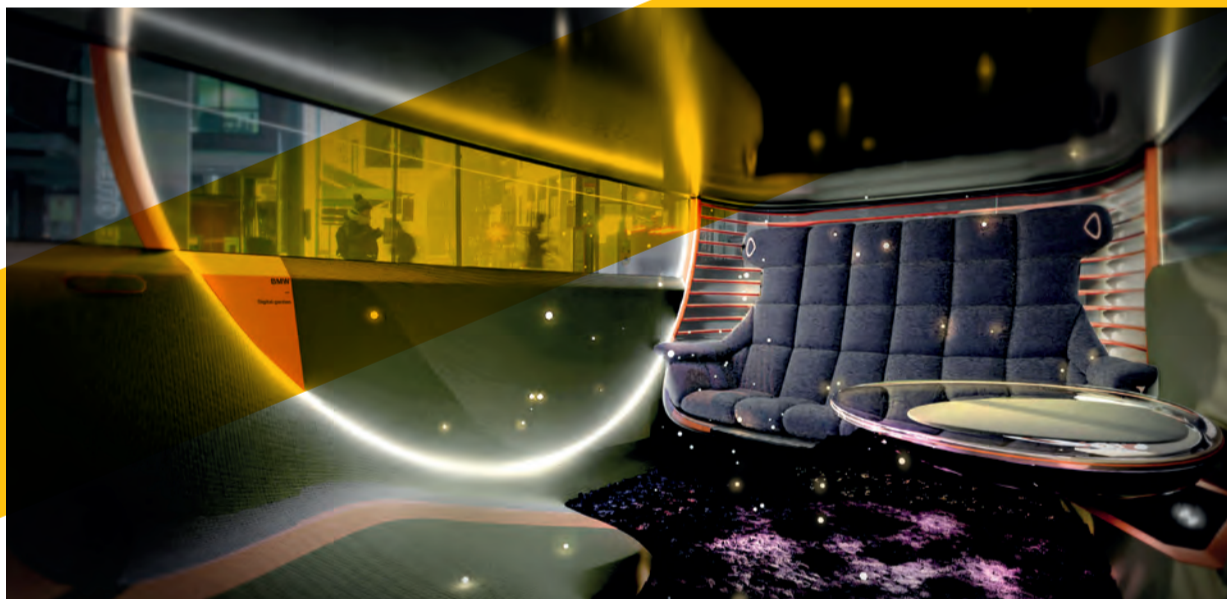
↑ Sooyoon Choi, BMW Digital Garden ↶ Zicheng Tang, Noma Kia Project